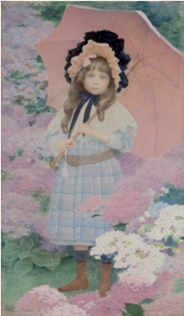
Children of Impressionism. Beyond images March 31 st – July 2 nd , 2023

In spring 2022, the musée des impressionnismes Giverny will present Children of Impressionism. Beyond images , an exhibition dedicated to the different facets of childhood at the end of the 19 th century, featuring works of Pierre-Auguste Renoir, Claude Monet, Camille Pissarro, Alfred Sisley, Mary Cassatt, Berthe Morisot.