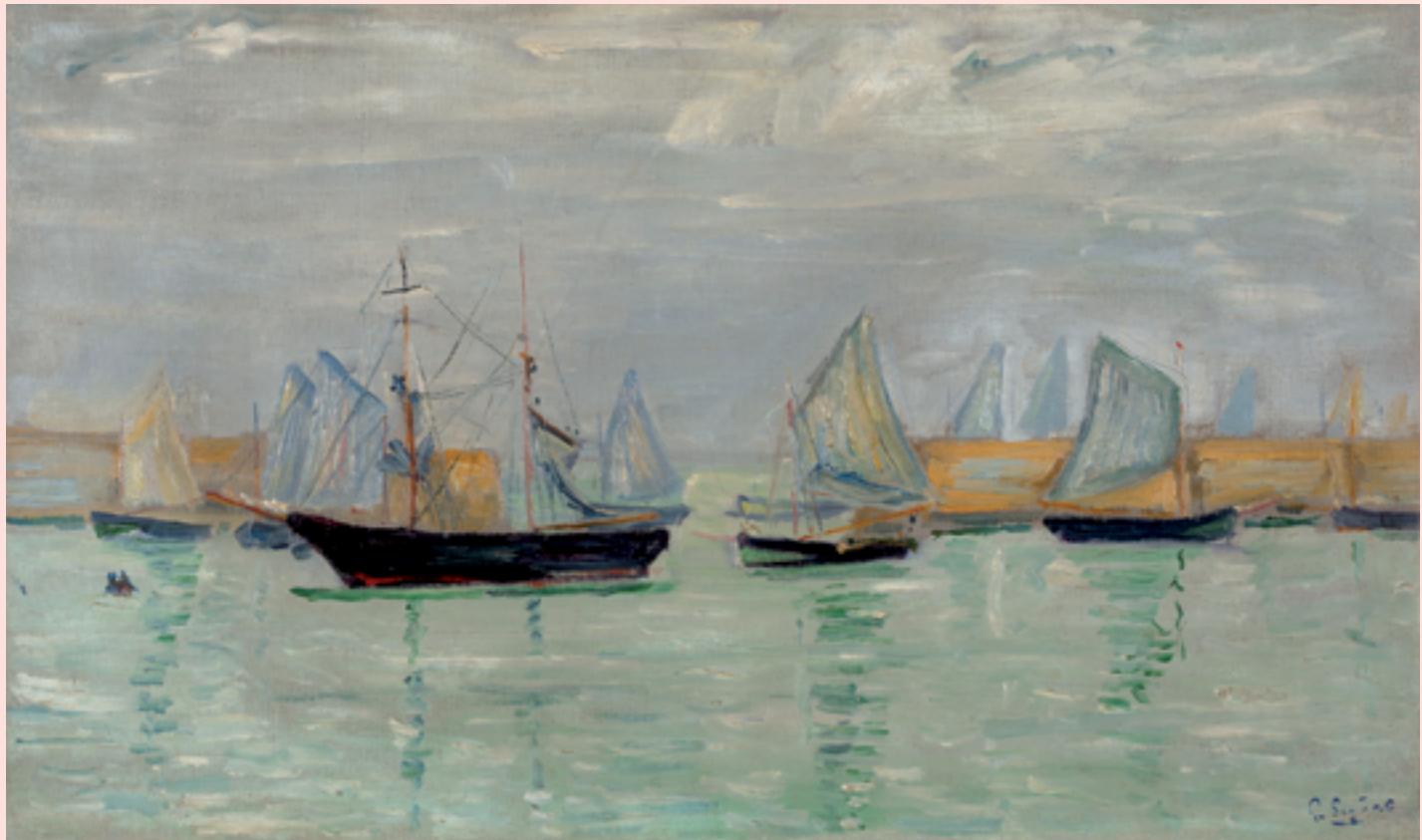
Paul Signac Étude Port-en-Bessin (étude n°5, l'avant-port), juillet 1882 – août 1882 Giverny, musée des impressionnismes, don de Charlotte Hellman Cachin en 2019

The museum will celebrate 150 years of Impressionism and will participate in the 5 th edition of the Normandy Impressionism Festival .